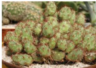
Photo of Airampo soehrensii